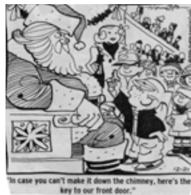
"In case you can't make it down the chimney, here's the key to our front door."

("I'll be home for Christmas") I'll be slim for Christmas, You can count on me. I pass up chips and chunky dips And ham and Spam and Brie. Christmas night will find me Where the fridge light gleams. I'll be slim for Christmas, But then comes Krispy Kremes.