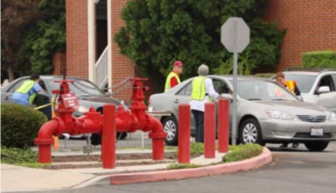
Circle of Friends Volunteer to Work Huntington Beach Flu Drive

When you travel with Circle of Friends...you travel with "FRIENDS"