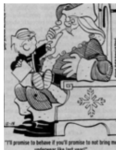
"I'll promise to behave if you'll promise to not bring the underwear like last year!"