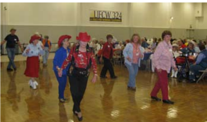
Lets Line Dance